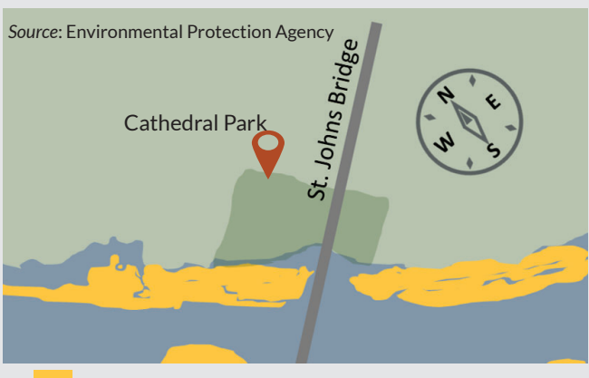
Active Cleanup Areas (approximate)

The EPA has developed a Portland Harbor Superfund Site Storymap about this site and the larger Superfund site. You can view it here to learn more and stay updated about the site: <u>https://bit.ly/3Hng7Bj</u>